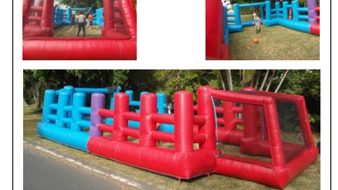
Inflatable Soccer field 8.5m x 4m R600 per day