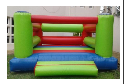
Spiderman Jumping Castle 4m x 4m R600 per day